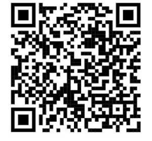
Scan for our PayPal link to donate

We are also happy to accept donations at our HQ of any unwanted books, DVDs, CDs and bric-a-brac. All donations, no matter how small, are greatly appreciated. All the best,